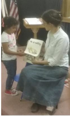
☞(Left) Teaching a song to the children ☞(Below) IBIMI mission retreat